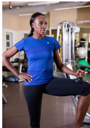
Condition Tee Shirt – $52