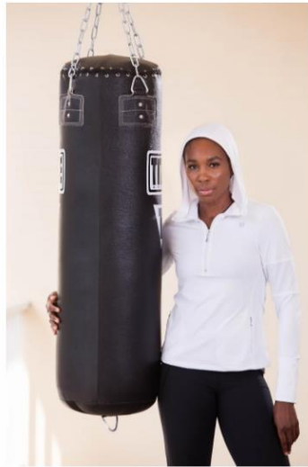
Sport Hoodie – $98