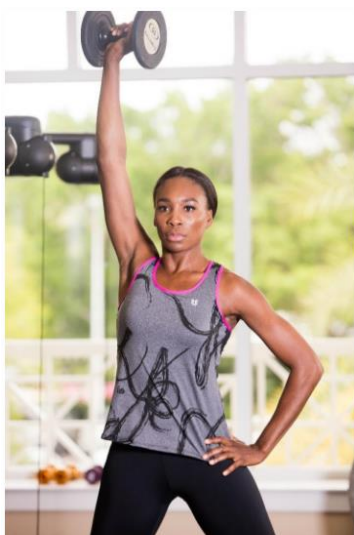
Oh and Oh Elevate Tank Print – $58